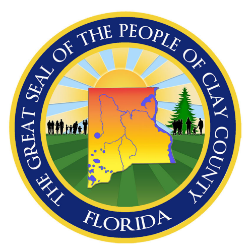
Estimated Population: 199,798

Located in Northeast Florida just south of Jacksonville, the dynamic and enticing Clay County is growing rapidly. It is in a great place now, and moving towards an even brighter future! In 2000, its population was just over 140,000. Today the Census Bureau estimates it to be approximately 200,000. Growth will not stop there – the excitement of anticipation is in the air! Within the next ten years, an outer beltway will be constructed through the area making large new areas in the south and southwestern parts of the County ripe for development.